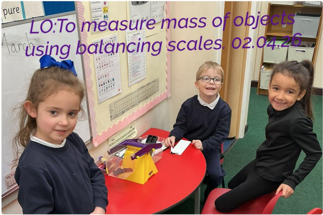
LO: To measure mass of objects using balancing scales. 02.04.26